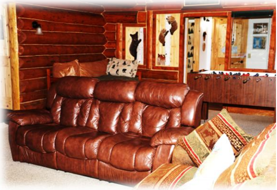
Bear Den Family Room

Please visit our website for information about our lodging. After you make your venue reservation, we will provide a discount code for your guest that they can use in our online system to make their reservation. Or they can call us at 979 415 4627.