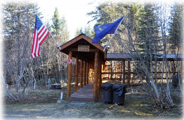
Moose Cabin Entrance