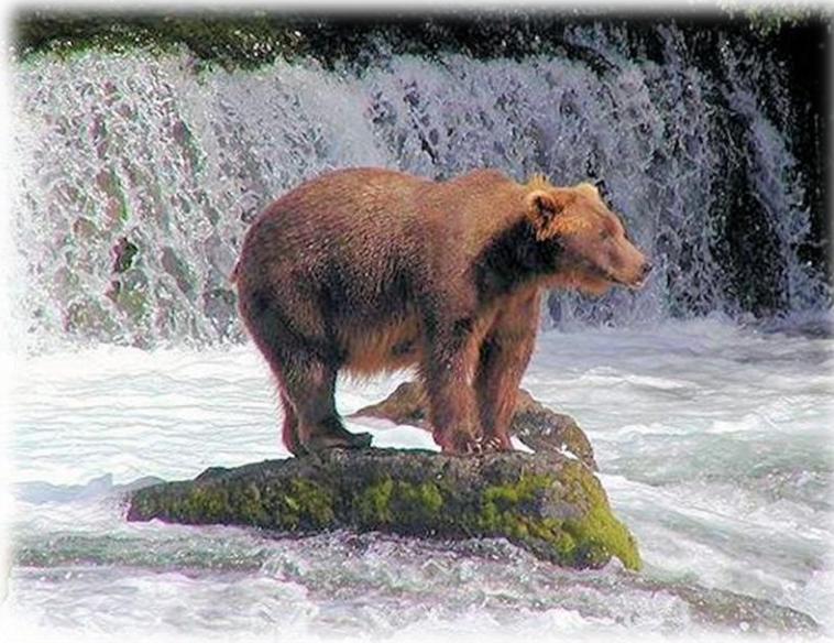
Bears at Katmai National Park

To explore some of your wedding reservation options Bear Paw Adventure To request information, email: alaska@bearpawadventure.com or call 979 415 4627.