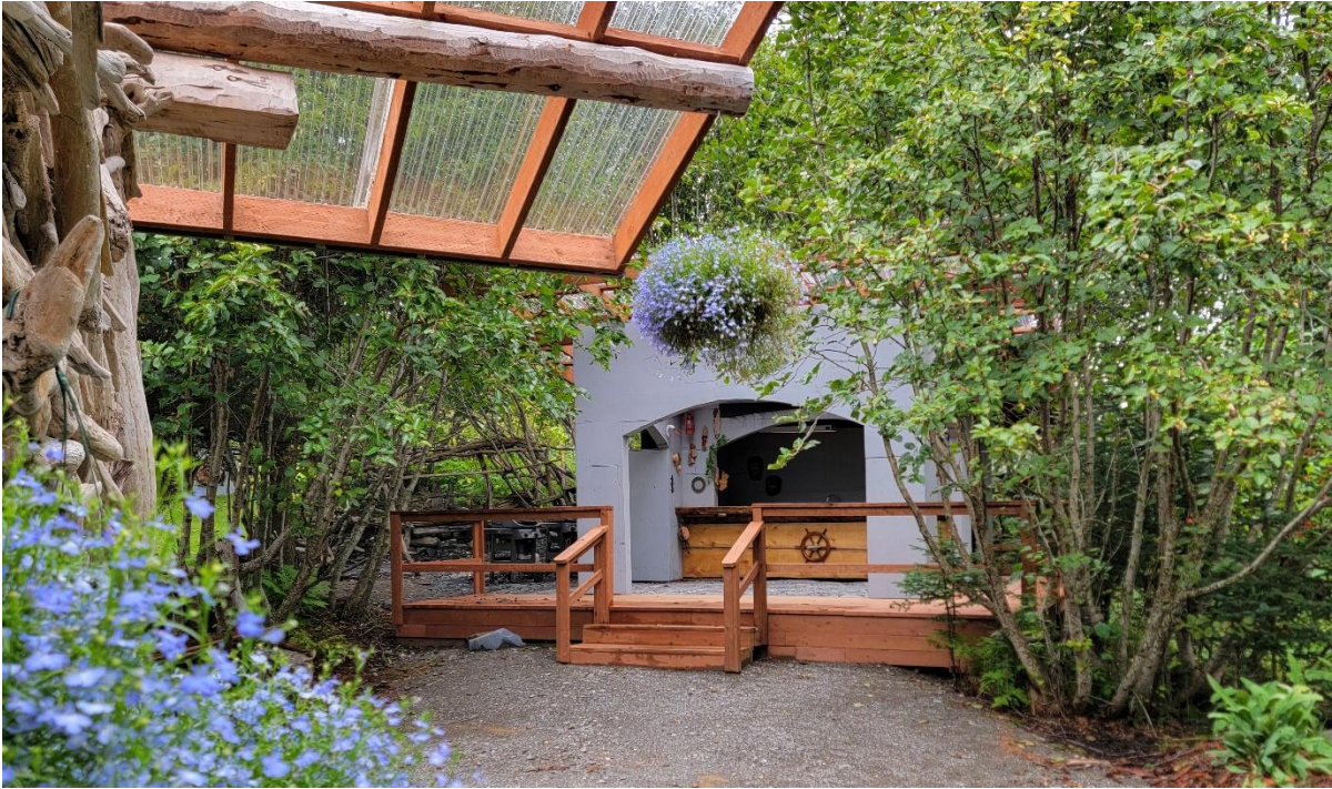
Refreshments and Food Serving