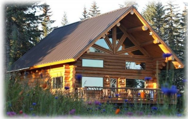
The Captain Cook Lodge

Lodging for your guests: We invite your guests and the members of the wedding party to stay with us in our unique, first-class log homes. In total, we can lodge up to 29 people in our four buildings.