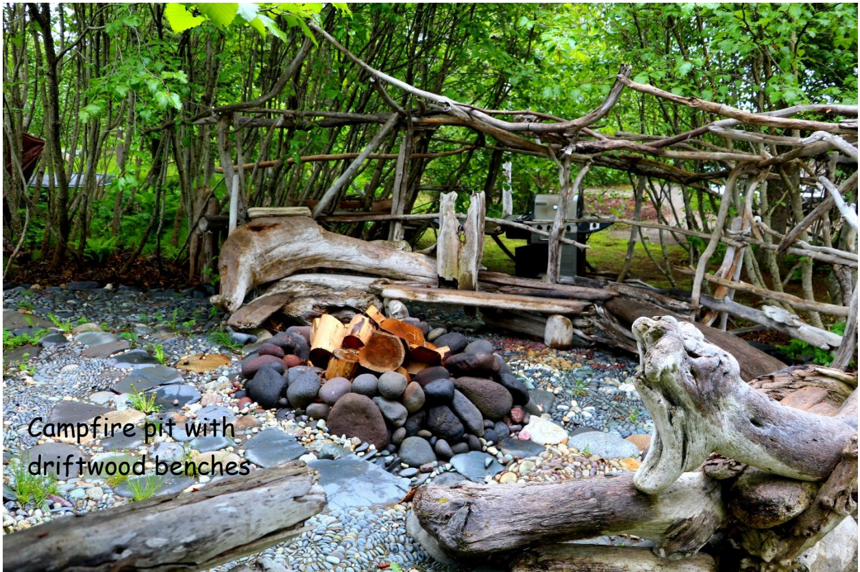
Campfire pit with driftwood benches