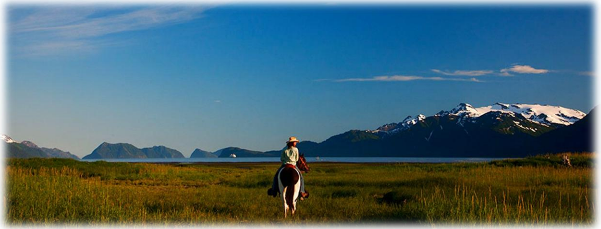
Enjoy a wide range of Alaska adventures, including this guided horseback ride.

Activities for your Guests: There are countless fun-filled Alaska adventures available in the area. These include fishing, wildlife viewing, hiking, kayaking, ATV rides, horseback riding, marine tours, and much more. See our website and the next section of this paper for more information about these fun-filled adventures. We will be happy to set up the tours your guests want. All they need to do is call us at 979 415 4627 and we will take it from there, booking them with trusted tour operators on excursions that we are experienced with.