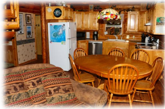
Kitchen at the Wise Old Hunter Lodge