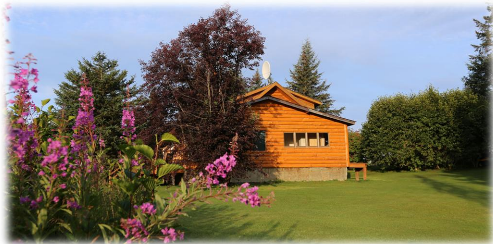
The Bear Den is included with your use of The Wonder venue

The bedroom also has a large, lighted mirror, makeup table and chair, and a hanger rack for wedding dresses. You will also find bottled water, snacks, emergency kit, extra chairs, and a steamer.