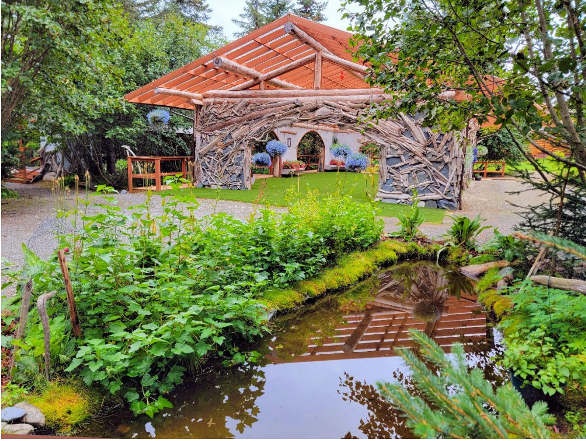
View of the Wonder and Reflection Pond