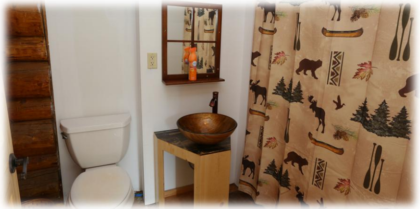
Bridal Suite Bathroom

Upon entrance to the Bridal Suite area from the Bear Den's family room, you first step into a small entry room that connects the family room with the bedroom chamber and the bridal suite's bathroom. There is a fourth door that opens to outside and to a raised deck where the couple can enjoy their morning coffee, breakfast, evening cocktails and meals in the fresh, clean, Alaska air - as they watch for moose that may be waking by. This small entry room also serves as an Alaska Native culture area where a few educational cultural exhibits are displayed.